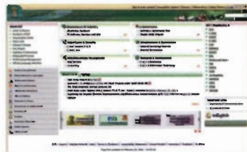
Department of Information Technology