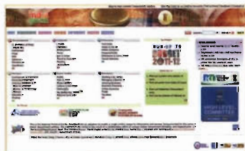
National Portal of India