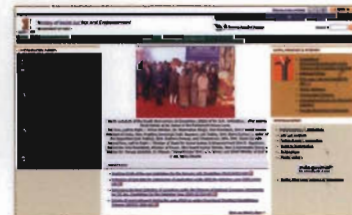
Ministry of Social Justice and Empowerment